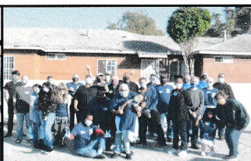
This year only our in house staff served as volunteers for safety reasons.

In the midst of today's commercial- ized Christmas many have hard- ened hearts to those in need, but we thank God for His grace and provisions as He continues to bless this Ministry that we may bless them.