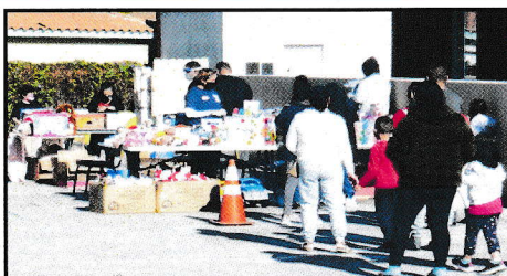
Despite the pandemic, every child received toys, gifts and every family received food.

Christmas is the time we celebrate the birth of our Lord Jesus Christ. It is also a time that is flooded with commercial advertising for toys, gifts, etc. Unfortunately, many families struggle to get through the Christmas season every year, especially this year. We were blessed to provide many families with hot meals, food bas- kets and toys & gifts for children. Due to COVID19 restrictions we