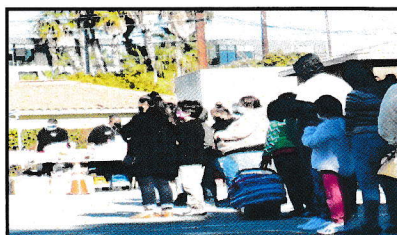
Hundreds of people that came this Christmas endured safety protocols and sometimes long lines, but families were patient.

were unable to have our traditional sit down dinner. However we were able to fellowship at a distance as we passed out hot meals in to-go containers. Also due to the restrictions we could not have outside volunteers, so our ministry staff & guest s cooked and prepared the meals, distributed toys and the word of God to every- one. Undeterred we were able to meet the goal of being safe, while at the same time showing Christian love.